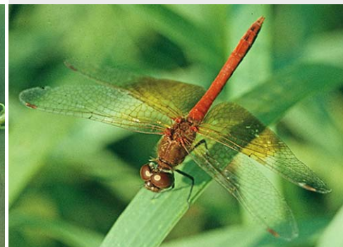
4 Sympetrum semicinctum ♂ Band-winged Meadowhawk: half amber wings. 26-38mm both sexes sometimes with black abdominal markings.