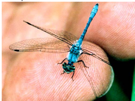
5 Nannothemis bella ♂ Elfin Skimmer: our tiniest dragonfly; female has wasp-like pattern on abdomen. 19-21mm