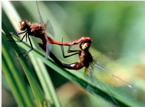
1 Sympetrum rubicundulum ♀/♂ Ruby Meadowhawk: male and female mating in "wheel" position. 34-38mm

Large, showy, frequently seen resting on or flying low over vegetation. Often hunt from a perch like Kingbirds. Also includes our smallest dragonflies (Nannothemis and Perithemis) and the ubiquitous Meadowhawks.