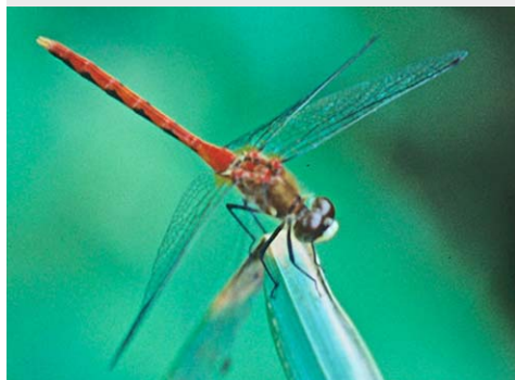
2 Sympetrum obtrusum ♂ White-faced Meadowhawk: white face. 32-36mm Above species are medium-sized and common. Adult males are usually red; females and immature males are yellow;

http://bugguide.ent.iastate.edu/node/view/191/bgimage http://cirrusimage.com/dragonflies.htm http://wisconsinbutterflies.org/damselflies/