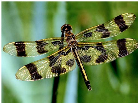
9 Celithemis eponina ♂ Halloween Pennant: sits on tips of vegetation even on the windiest days. 34-39mm