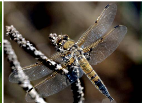
10 Libellula quadrimaculata ♂ Four-spotted Skimmer: stout body; amber and black wing markings. 42-49mm