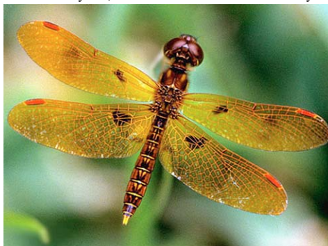
6 Perithemis tenera ♂ Eastern Amberwing: male has amber wings. 19-25mm