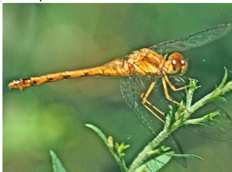
3 Sympetrum vicinum ♀ Yellow-legged Meadowhawk: yellow legs. 30-36mm