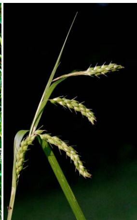
11 C. davisii