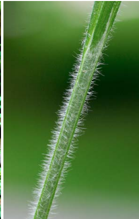
6 C. hirtifolia