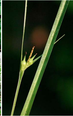
2 C. jamesii