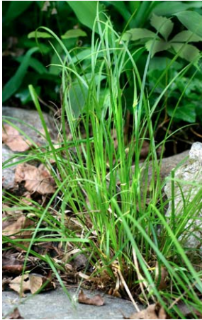
1 C. jamesii