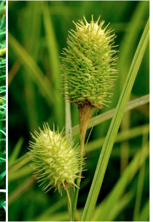
4 C. squarrosa

GRASS SEDGE: spike solitary, tipped with staminate flowers; inflorescence with long, leaf-like lowermost pistillate scale, which resembles the bracts subtending spikes in most other sections; perigynia bodies globose, beak almost conical. Mesic woods.