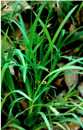
5 C. hirtifolia

Some spikes wholly female; often pedunculate spikes; plant hairy all over, as in C. hirtifolia and C. swanii (2a); or, only perigynia or foliage pubescent (2b).