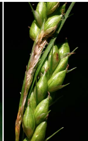
12 C. davisii