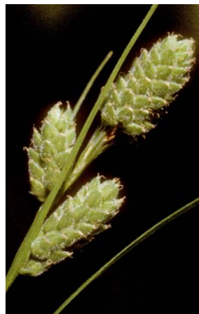
9 C. swanii