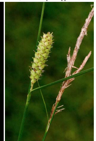
13 C. pellita

DOWNY GREEN SEDGE: ...perigynia; perigynia gray-green, beakless, pubescent with long, spreading hairs. Usually dry open woods (e.g. oak savannas).