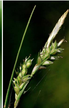
7 C. hirtifolia