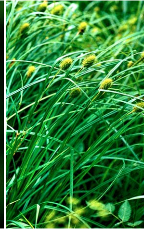
3 C. squarrosa