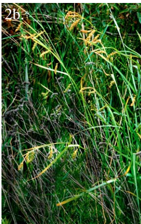
10 C. davisii