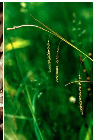
51 C. buxbaumii 52 C. buxbaumii DARK-SCALED SEDGE: terminal spike bisexual, resembling an ice cream cone topped w/ perigynia; pistillate scales dark-margined, tapering to a long-pointed apex; perigynia whitish to gray-green, granular, beakless to short-beaked. Calcareous wetlands.